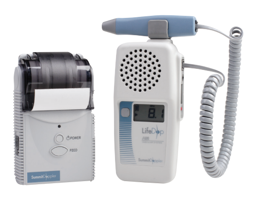
LifeDop® 250 ABI System